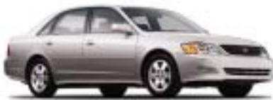
2002 Toyota Avalon