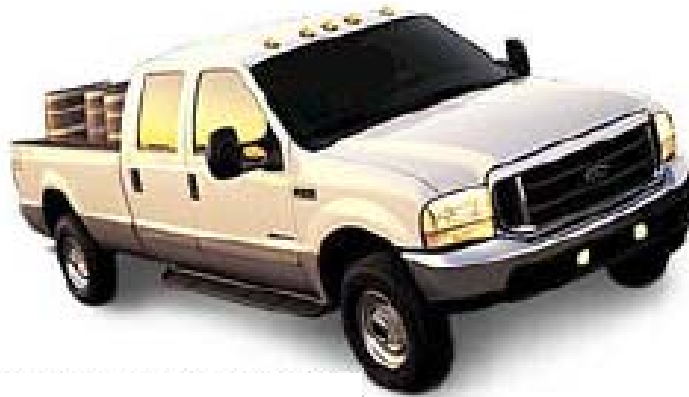
2002 F-250 Crew Cab, made in Louisville, KY