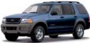
2002 Ford Explorer