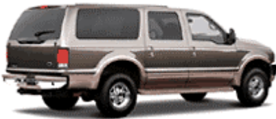
2002 Ford Excursion