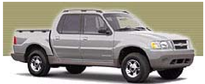
2002 Ford Explorer SportTrac, made in Louisville, KY