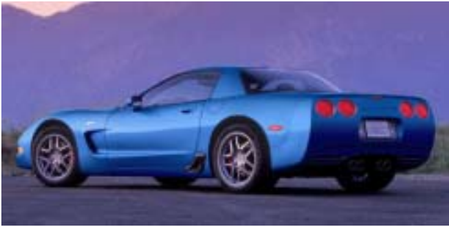
2002 General Motors Corvette, made in Bowling Green, KY