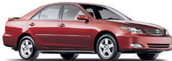
2002 Camry, made in Georgetown, KY