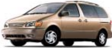
2002 Toyota Sienna